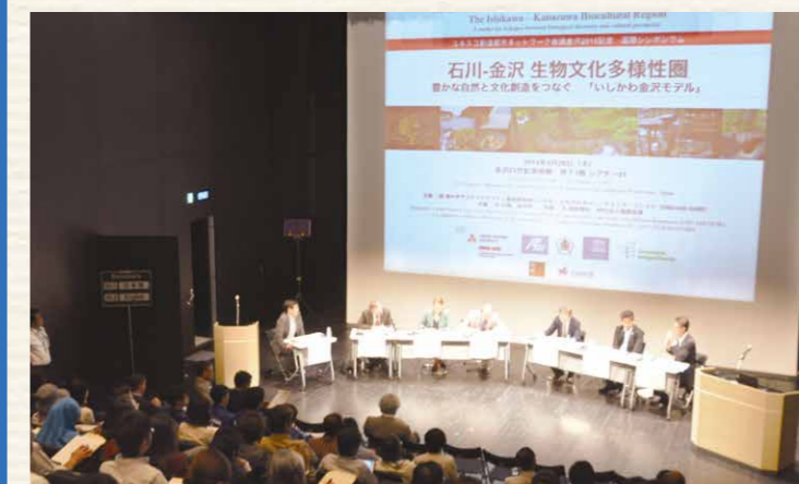
Holding international symposiums to widely publicize Kanazawa City efforts