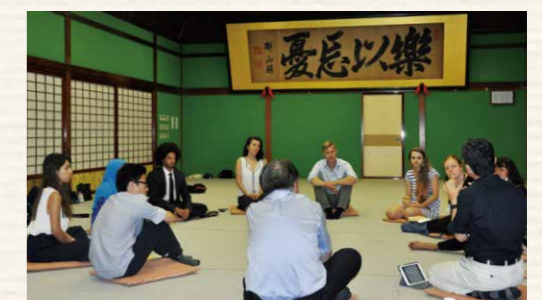
Holding workshops on biocultural diversity with Kanazawa University