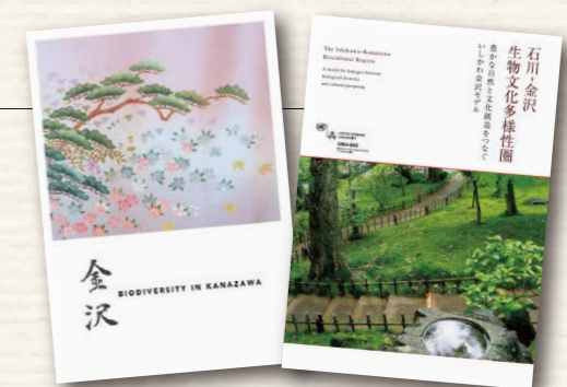
Use publications to advertise globally