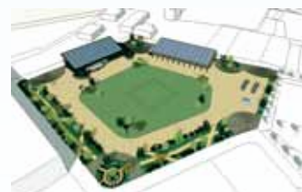
Development of disaster prevention facilities