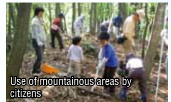
Use of mountainous areas by citizens