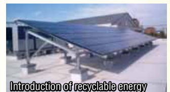
Introduction of recyclable energy