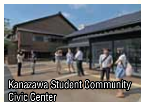
Kanazawa Student Community Civic Center